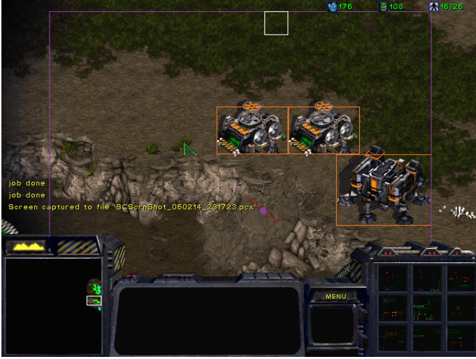
Fig. 1. Example of a wall found using the wall-building algorithm. Choke point is indicated with a red line and a purple circle.

In our approach we use a wall to seal off a choke point. A choke point is a location on the map (terrain) that connects two regions [5] (see also Figure 1). If a wall is built near this choke point, then the two regions of the choke point are separated (no longer reachable by ground units).