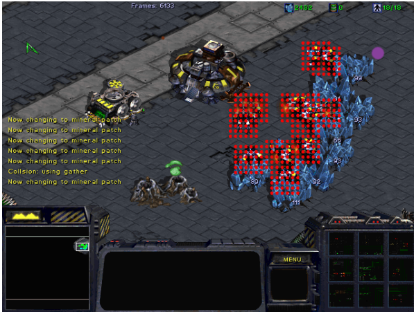
Fig. 2. Example of co-operative pathfinding with collision avoidance indicated by the red dots. The numbers on the mineral fields indicate travel time. The purple circle indicates the location of the empty space trick.

Although both the scheduling and the pathfinding are not optimal, combined they increase the gather rate more than all the other algorithms discussed. It is possible to improve a mineral gathering algorithm in terms of both pathfinding and scheduling. Regarding pathfinding, it is sometimes the case that the path from the mineral field to the resource depot can be improved. Regarding scheduling, the queue based algorithm uses a greedy scheduling that does not plan ahead.