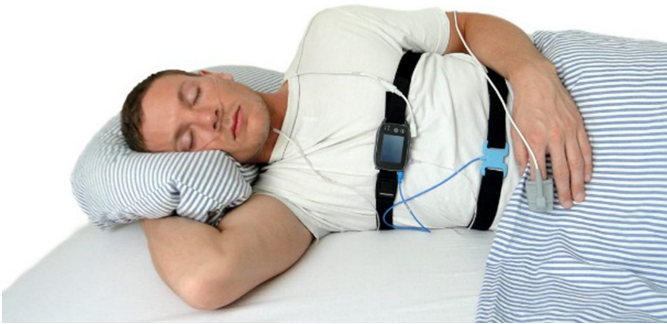
Fig. 2. Sleep and vegetative sensors.

but also health-related variables such as disease duration and medication intake. This questionnaire supports better classification of the qualitative data.