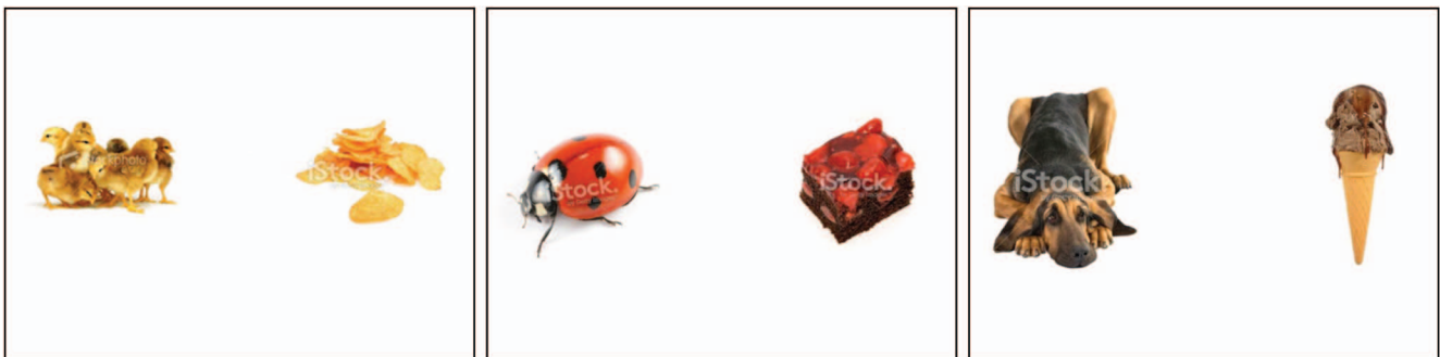
Figure 1. Examples of critical picture pairs depicted in the visual probe task. Pictures are depicted here with watermark due to copyright. However, in our study, pictures were displayed without watermark. See the online article for the color version of this figure.

Stimuli. In critical trials, the image pair consisted of a picture of a high-calorie food item and a picture of an animal (e.g., crisps and little ducklings; see Figure 1 for illustration). Filler trials consisted of picture pairs depicting two neutral nonfood photographs (e.g., shoes and furniture). All image pairs were matched as closely as possible with regard to color, complexity and brightness, and size of the depicted object. A pilot test was conducted to match