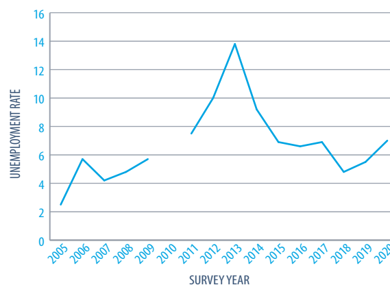
Table 1 gives an overview of graduates' unemployment rates by cohort and faculty. The unemployment rate of the cohorts that graduated five and ten years ago is 2%. As this is similar to last year, the COVID-19 crisis seem to only hit the unemployment rates of the newcomers on the labour market. This is in line with school leavers being hit hardest in times of economic crises. 6

Trends in unemployment rates 1.5 years after graduation