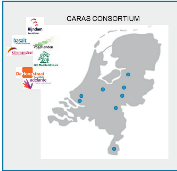
Figure 1. Rehabilitation centers in the Netherlands who joined the CARAS Consortium between 2014 and 2019