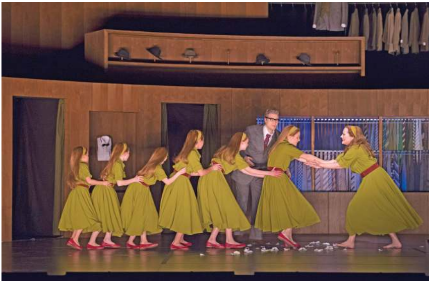
Figure 14.2 Interpretation of Richard Strauss's opera 'Salome' by Claus Guth, Deutsche Oper, Berlin, January 2016.