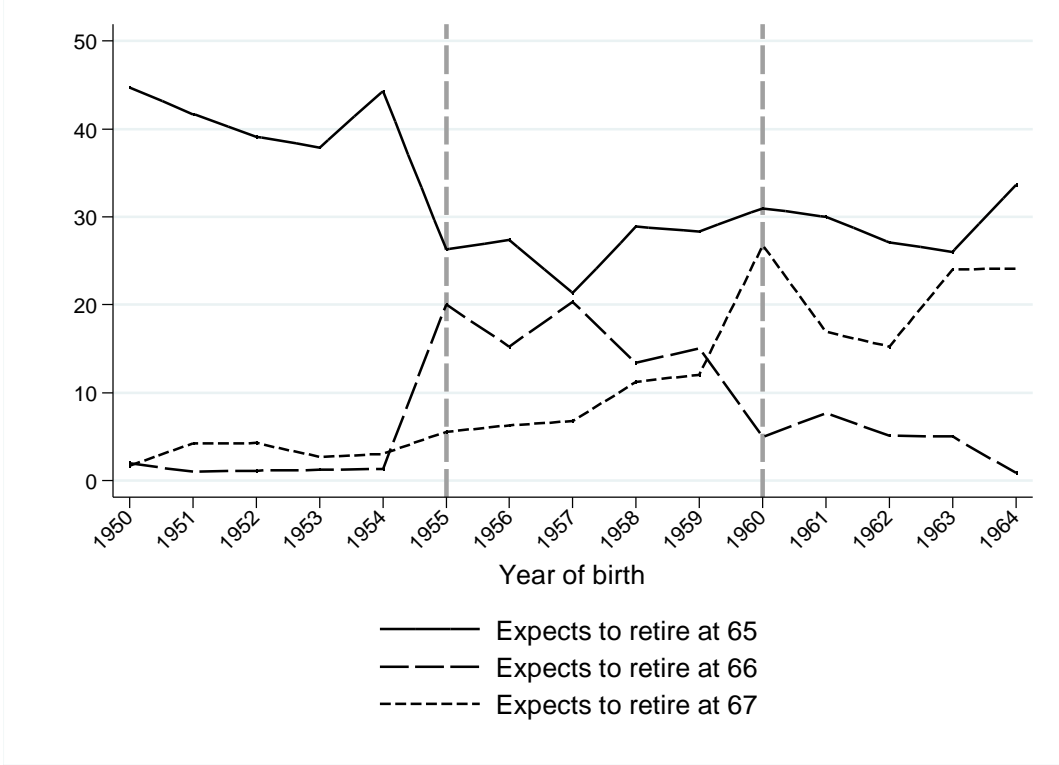
Figure 1: Percentage of employees who expect to retire at age 65, 66, or 67, by birth year