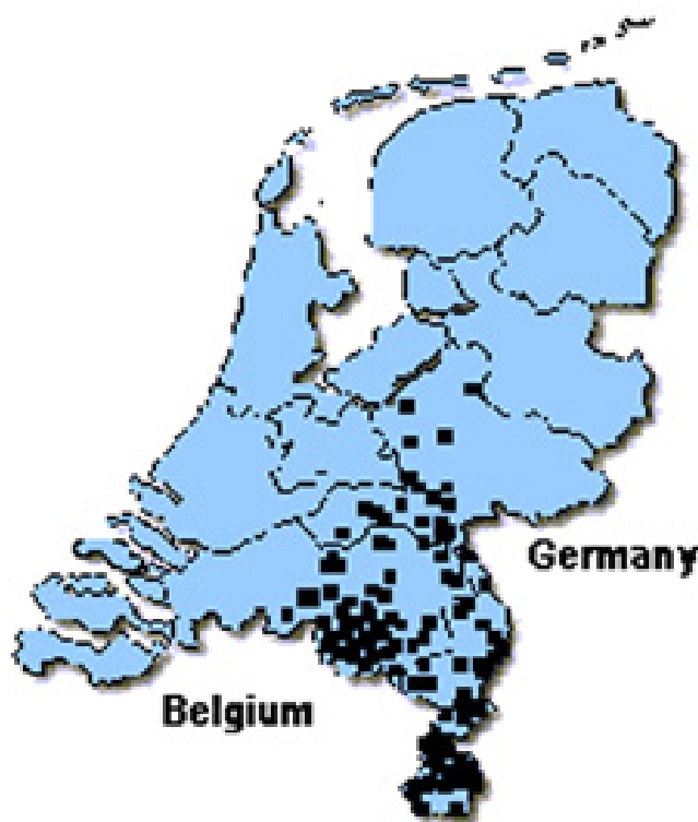
Figure 2 The location of participating midwives and gynaecologists in the Netherlands.

Recruitment of women into the study began in November 2000 and ended in November 2002. Approximately 10,850 women were asked to participate in the study by midwives and gynecologist in the southeast of the Netherlands. The locations of the participating midwives and gynecologists are shown in Fig. 2. At the end of the recruitment period 7,526 pregnant women (73.4%) were willing to participate and were included in the cohort.