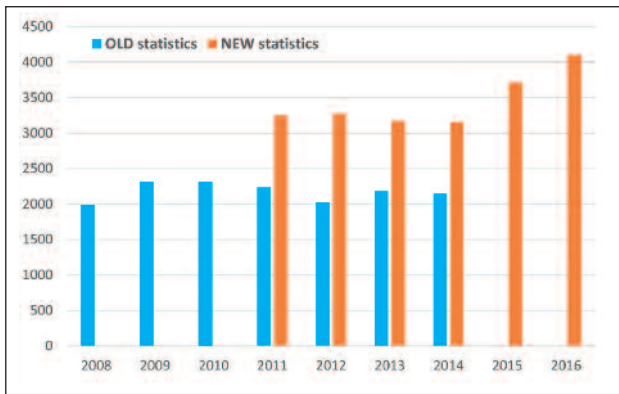
Figure 3: Annual number of decisions in opposition proceedings

It is interesting to observe that the decisions in the years where both statistics are available show different trends. For instance, there is an increase in the number decisions from 2012 to 2013 in the 'old' statistics, whereas the 'new' statistics show a decrease in the number of decisions in the same period.