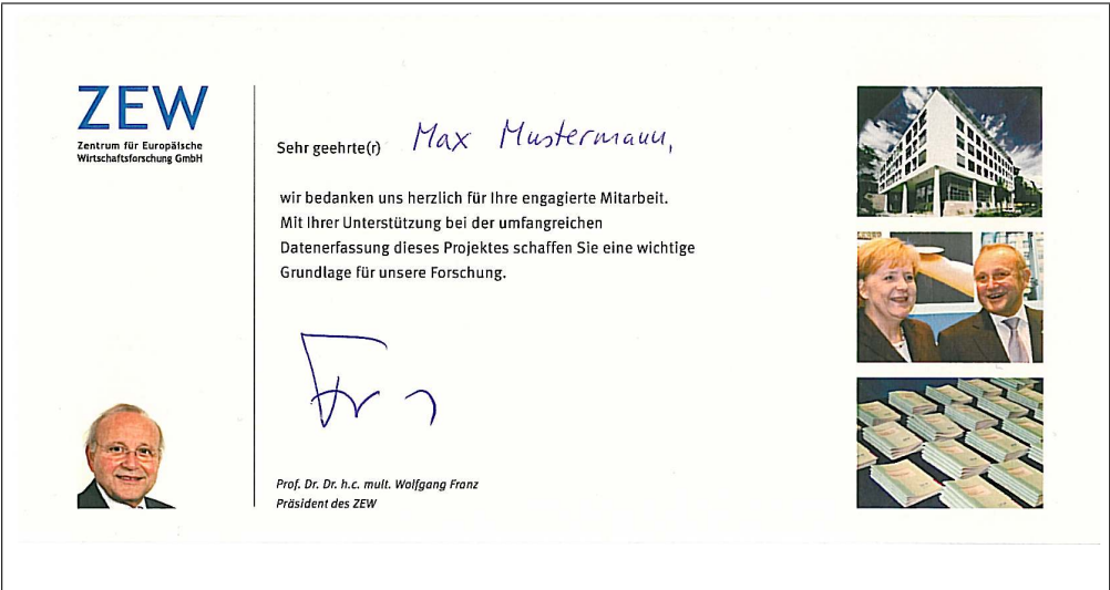
Figure 1: Thank-you Card