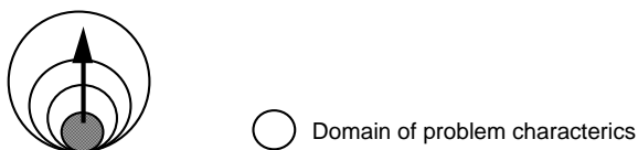
Figure 1: The rippling process

n+1 dimensions as a starting point and develops a model for n+2 dimensions. The knowledge machine in this metaphor is to a large extent programmable, both in a theoretical and in a methodological sense. In the existing theory, one seeks a white area of inconsistency, from which a new dimension is derived. The research question is adjusted and the accompanying method is looked up in the methodological recipe books. As the rippling goes on, the research is becoming increasingly predictable until the researcher runs into a brick wall and is forced to digress (Reisman, 1988, p. 217). However, often researchers do not notice that they run into difficulty. They are driven by an unprecedented longing to bump into the wall of a completely hollow yet fashionable theory. Only a minority takes the risk of digressing.