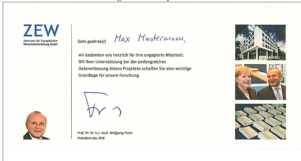
Figure 1: Thank-you Card