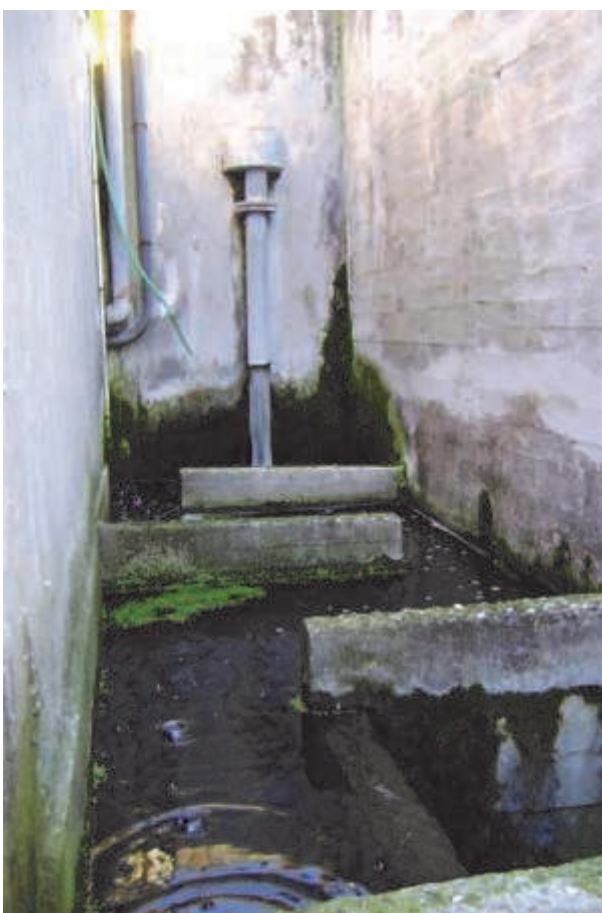
Pilot project: Castel St'Angelo, Italy

THE ISSUE. Utilities and technology companies tend to underestimate the social dimension of sanitation, not to recognise the social, organisational and economic aspects of technology transfer and to give little importance, as pivotal as-