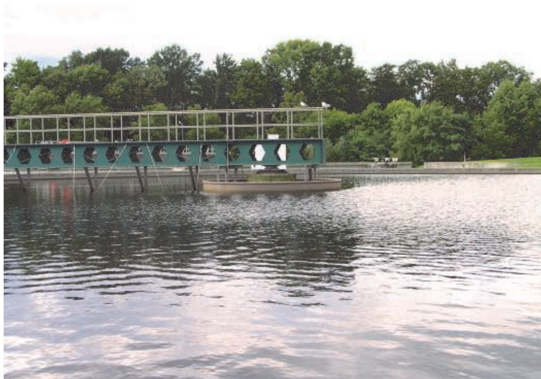
WBL Wastewater Treatment Plant in the Limburg Province, The Netherlands

The book summarises the main findings pertaining to knowledge brokerage in the EU-FP7 project BESSE (Brokering Environmentally Sustainable Sanitation for Europe), while the Resource File was conceived as a publication that provides background material for the book and that gather the main documents produced in the framework of BESSE.