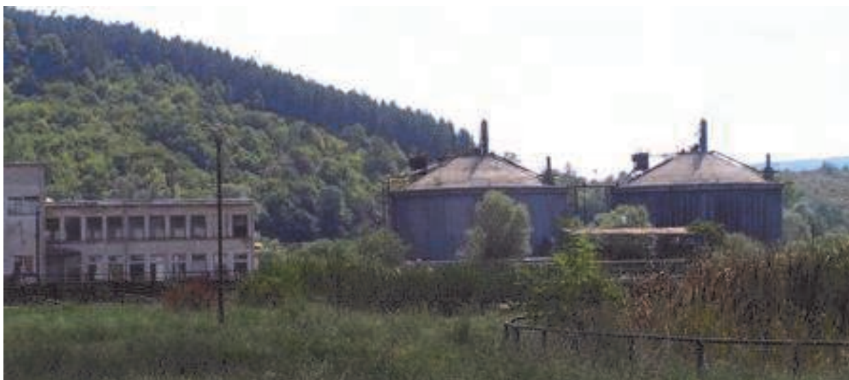
Pilot project: Pernik, Bulgaria

THE ISSUE. It is a widespread belief that traditional sanitation systems have definitively solved the problem of liquid waste management, without damage or risk to the environ-