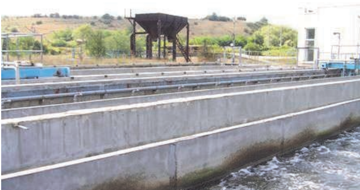
Pilot project: Pernik, Bulgaria

THE ISSUE. One of the critical points - perhaps the most important - hindering innovation in sanitation is the reluctance of utilities to dialogue with research institutions. This is a problem, which, as we have seen (see Recommendation 5), appears to be the mirror image of a similar reluctance shown by researchers to interact with companies. Knowledge brokerage, in this context, is expected to perform one of its typical functions, i.e. to establish communication channels enabling people who use scientific knowledge and technology to interact with those who produce it so as to facilitate the transfer of knowledge. The