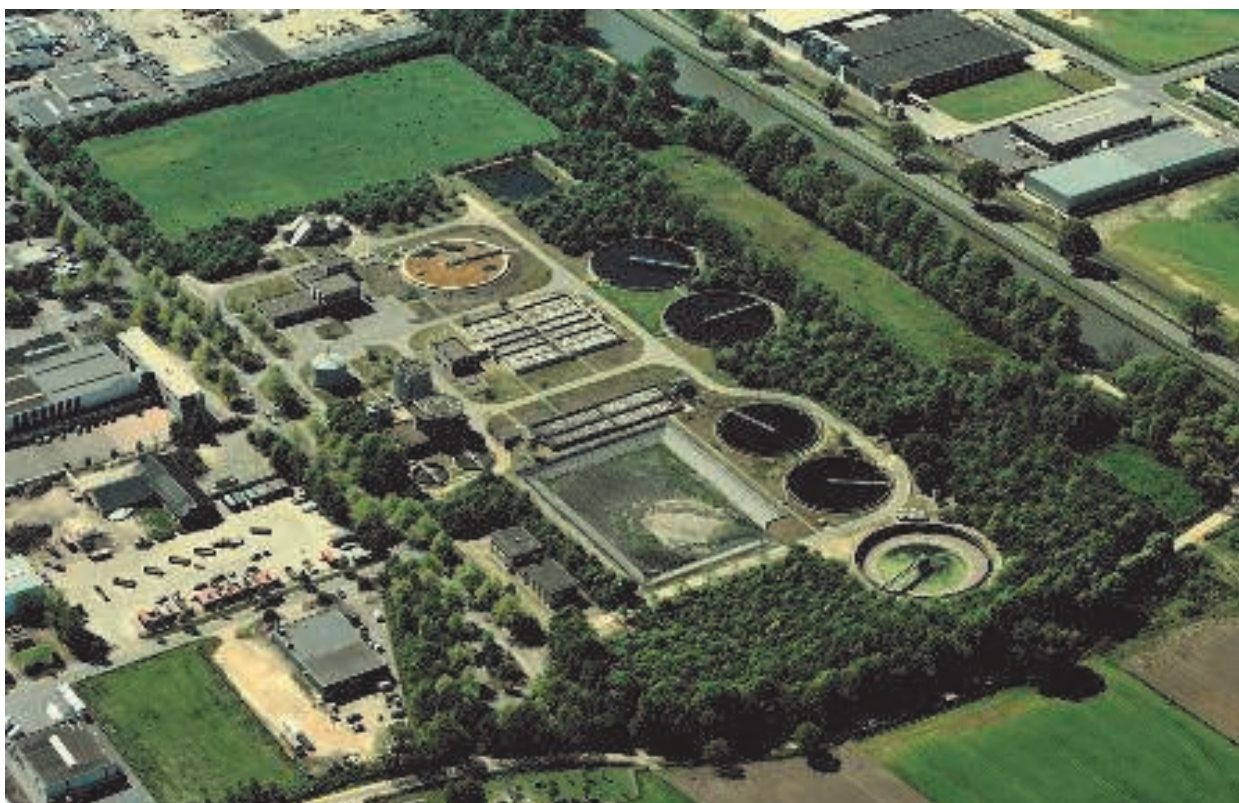
Pilot project: Limburg, The Netherlands

ACTIONS. Involvement of decision makers in public seminars and initiatives on sanitation; production and dissemination of publications, toolkits, guidelines and sourcebooks on sustainable sanitation in relation to other environmental issues specifically conceived to be read by policymakers; production of policy briefs and policy papers on ESS; awareness raising programmes addressing local authorities; collection and dissemination among policymakers of information and statistical data on risks related to traditional sanitation systems and on benefits deriving from ESS-oriented technologies.