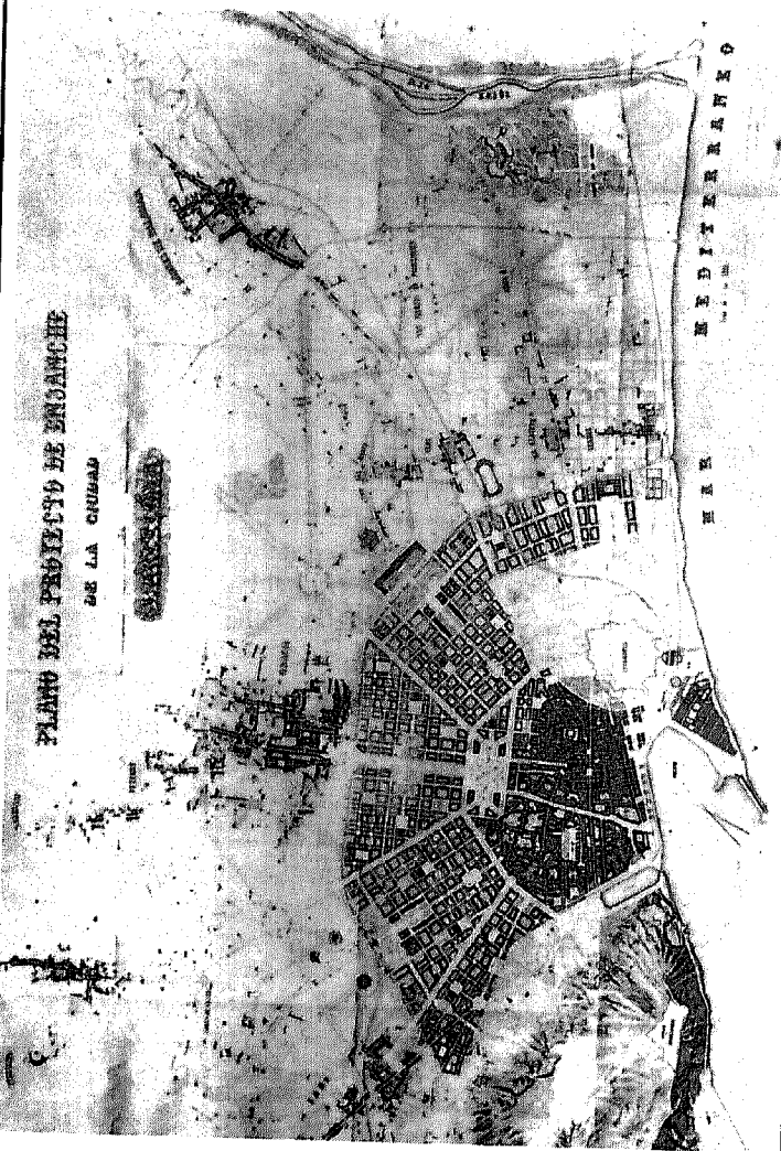
Figure 2. Antoni Rovira's extension plan, 1859.