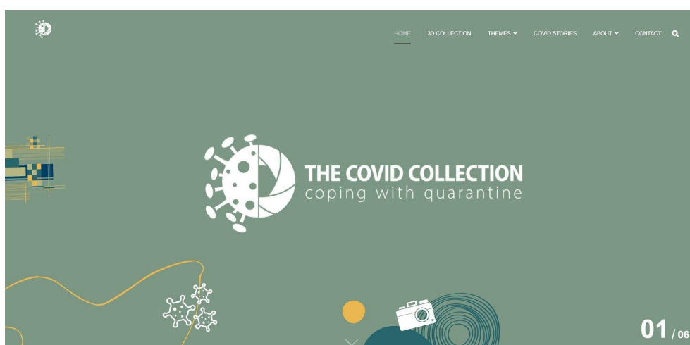
Figure 1: The Homepage of the project "The Covid Collection: Coping with Quarantine" (Available at: https://covid3d-umfasos.nl/ )

On the other hand, cultural heritage is often conceived very narrowly, as for example, a monument, an artefact, or a work of art. However, Smith (2006) highlights that people, especially those excluded from the Authorised Heritage Discourse, give a much broader definition to it, as for example, a memory or a family history. All heritage is, therefore, intangible (Smith, 2006, p.3), not only because it takes the meaning and value we assign to it but also because of how it shapes society. COVID-19 has already left, and still generates, many tangible and intangible remains that should be captured as our heritage, and the same is the case with peoples' experiences during the pandemic; experiences that may be connected to objects, people, and stories that obtained new meaning and value during this time. Of the class of 37, a great variety of objects were selected: from a Peruvian Mate cup to a meditation pillow, to headphones, to hand-painted game pieces, to an analogue camera, to a banana bread, and board games. The objects represented all aspects of the students' lives: how they spent their free time, how they studied, how they mitigated their anxieties, and how they coped with the physical and social isolation.